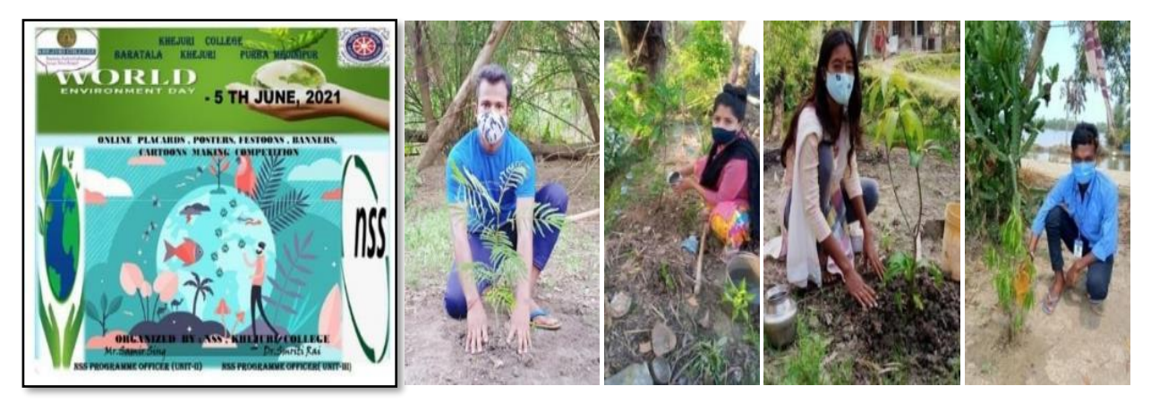
Plantation on World Environment Day