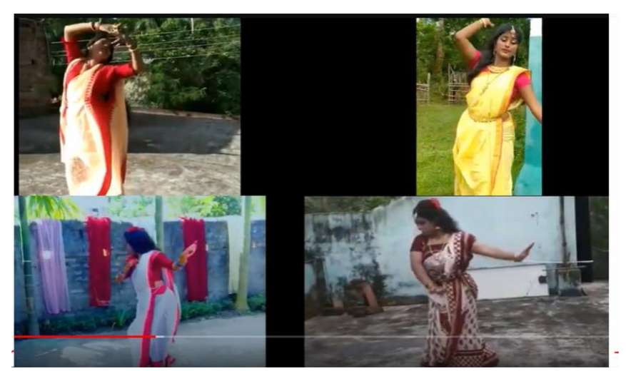
Online Agomoni Utsab