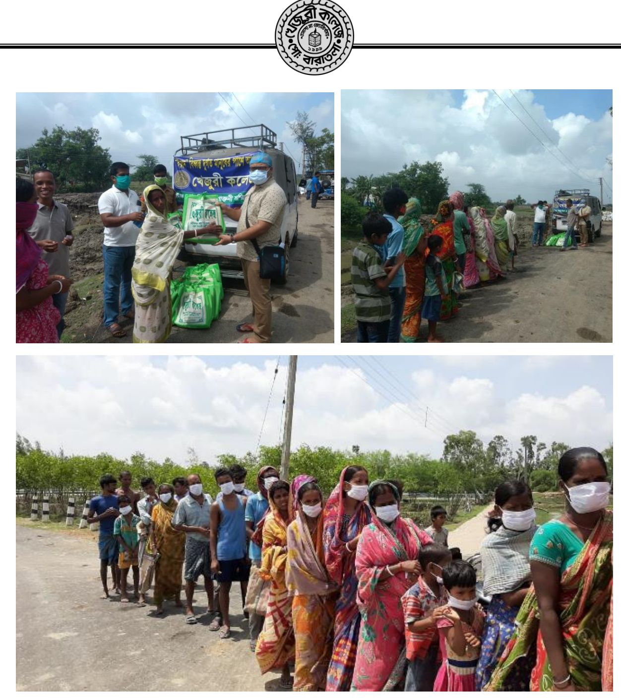
Relief Works for Yaas Cyclone affected People